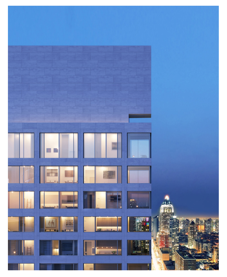
611 West 56th Street by Portuguese award winning architect Álvaro Siza is a new collaboration by Sumaida + Khurana and LENY in New York.